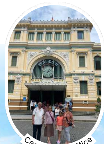
Centre Post Office