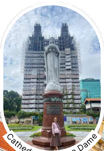
Cathedral of Notre Dame

Distance Tan Son Nhat Airport - Saigon Central: 7 – 8km -> 30 minute transfer