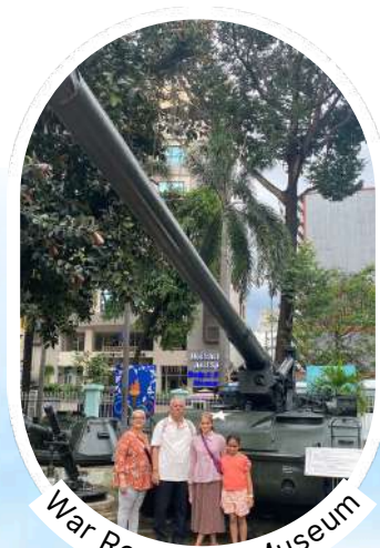
War Remnants Museum